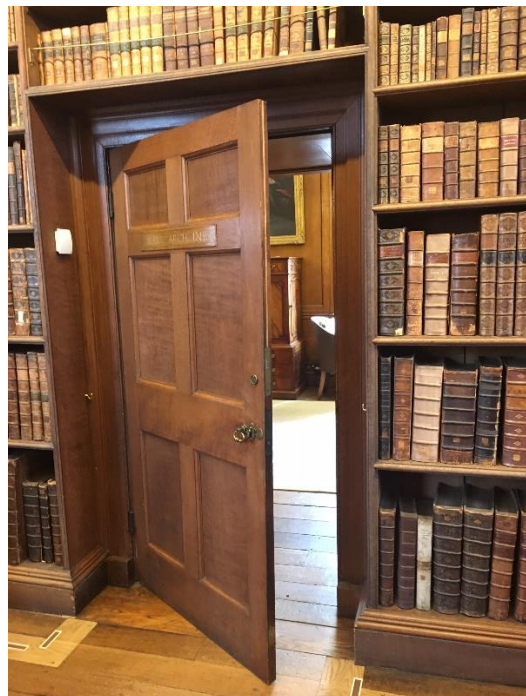
Christ Church Library, University of Oxford