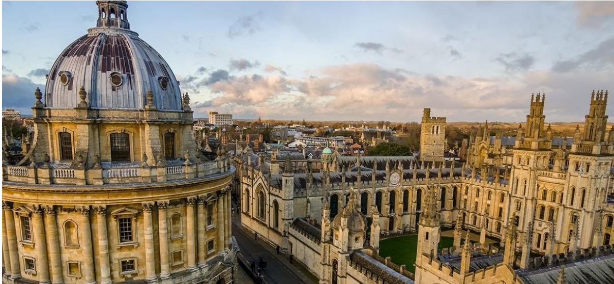
Oxford, Radcliffe Camera and All Soul's College.