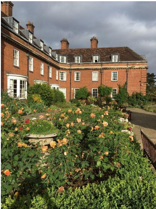
St Hugh's College, University of Oxford