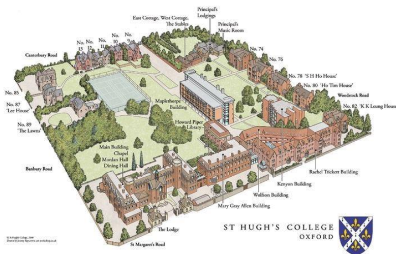
St Hugh's Campus – map